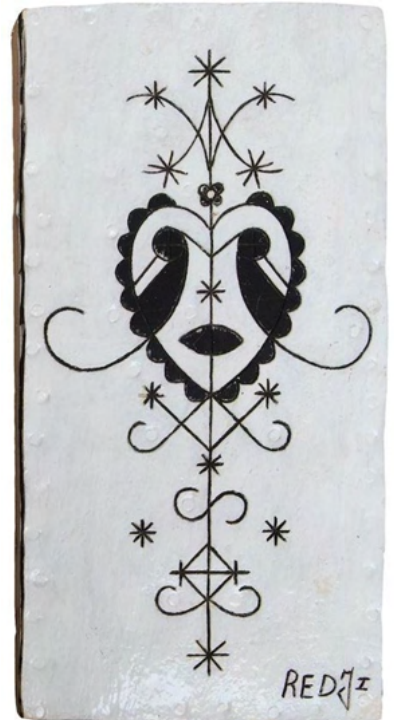
Reginald Senatus, "Ezili", 10" x 5", oil, rubber, wood.