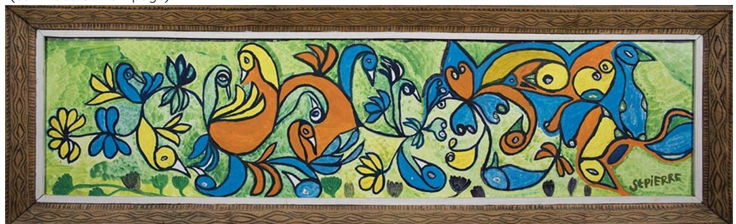
Untitled, n.d. by Saint-Pierre Toussaint