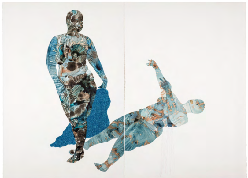
But I Have To, 2019