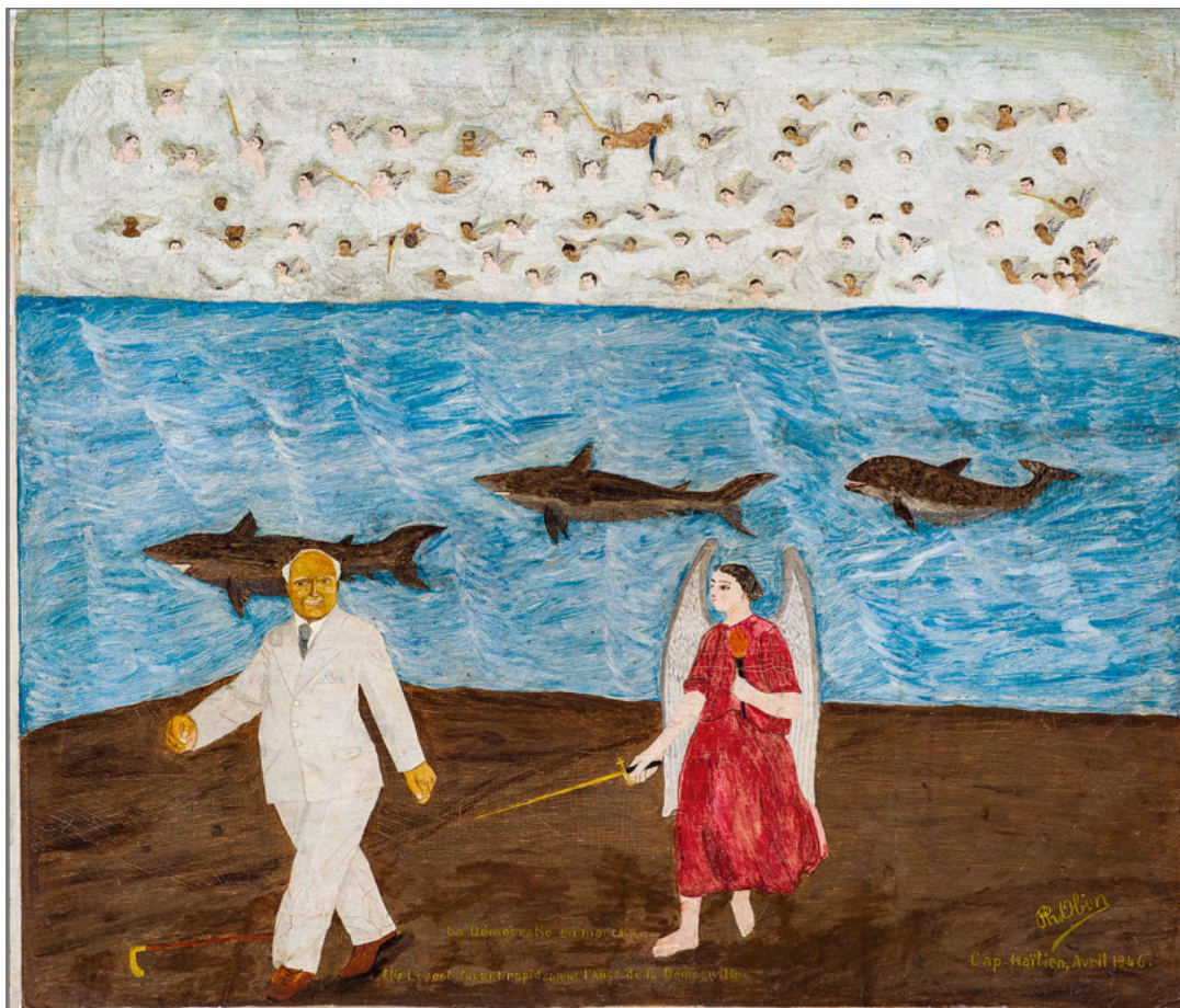
La Democratie En Marche , 1946 by Philome Obin