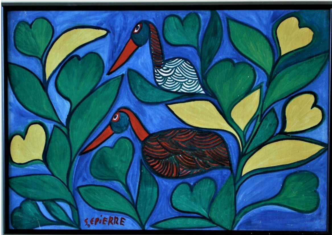
Untitled, n.d. by Saint-Pierre Toussaint