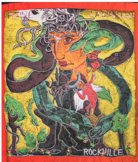
Reine La Diabless, 2006 by Roland Rockville