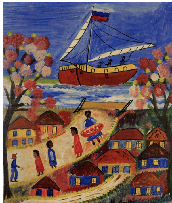
Harbour town, 1946-48 by Hector Hyppolite