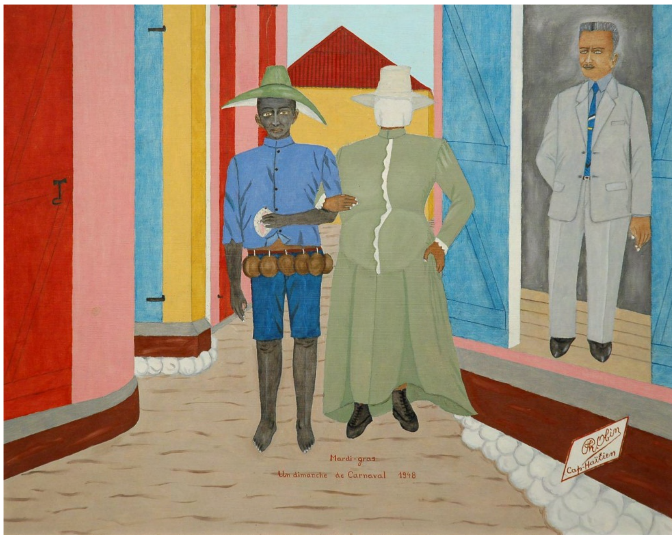
Un dimanche de carnaval (a Sunday carnival), 1948 by Philomé Obin

Yes, there are many Haitian arts. Haitian artists like many everywhere and in all times are busy extending or breaking categories as well as unique presentations from within an existing esthetic formula. If we give names to groups of artists who share a common daily and visual language, let us be aware as writers and collectors that our categories all have amorphous, labile intersecting or separate boundaries. Let us be attentive to the artists who urgently implore us to pay attention to the works rather than to imposed categories and their limiting names.